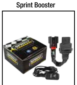
P/N: 77-13004 (M/T) 77-13005 (A/T)