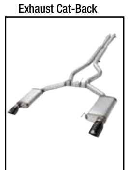
P/N: 49-33072-B (Blk Tip) 49-33072-P (Pol Tip)